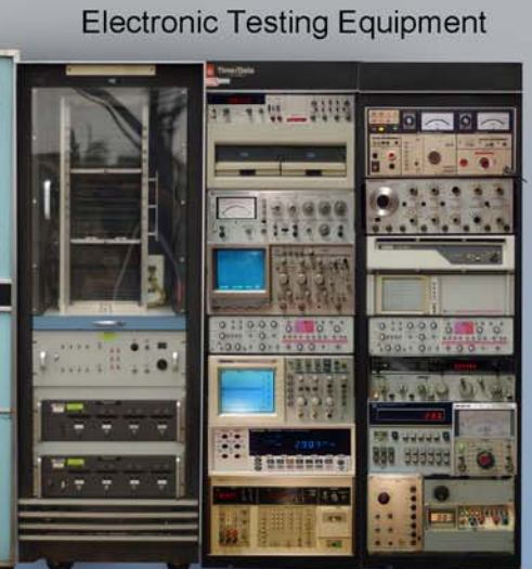
Electronic Testing Equipment