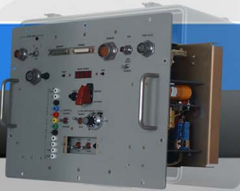
Engine Test Equipment

Turn key and electronic kit assembly and manufacturing Integration of systems and subsystems, Harness assembly Electronic switching assembly, circuit board assembly, Environmental testing is available for life testing and burning testing Development and Engineering services are available.