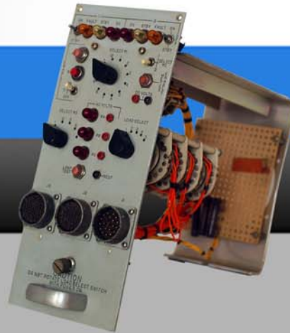
Voltage Test Switching Assembly