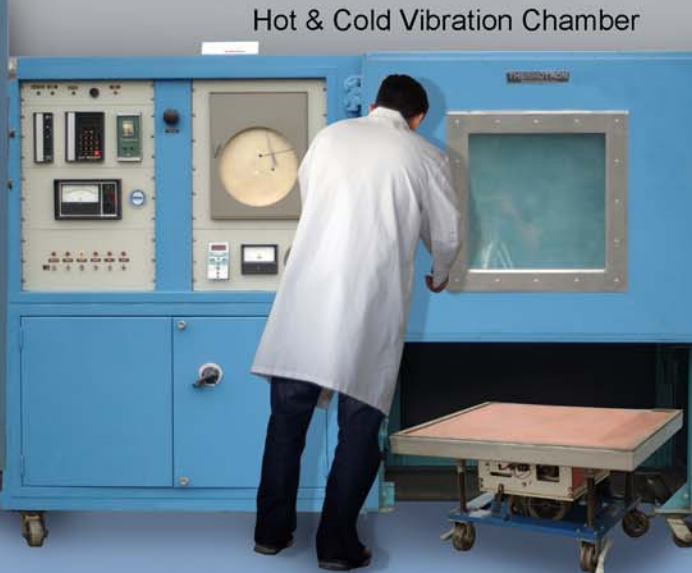
Hot & Cold Vibration Chamber